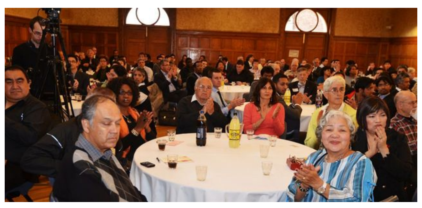
Northcote Town Hall - Open Forum, Strengthening the role of community, NGO's and business in cross-cultural understanding and building inclusive societies