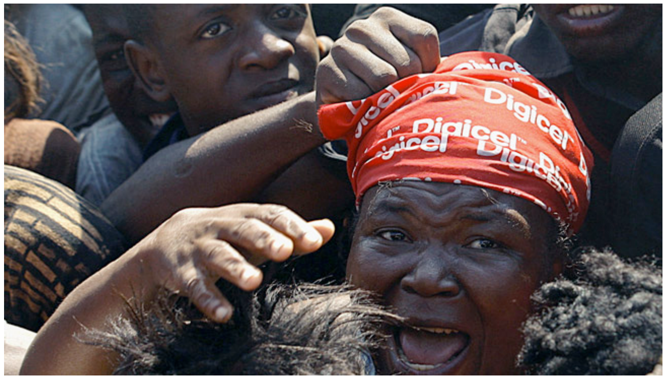
Australia's foreign aid is to be focused on the Asia-Pacific, and help phased out to India and China