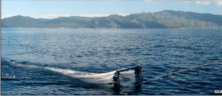
Nets are dragged half-in and half-out of the water