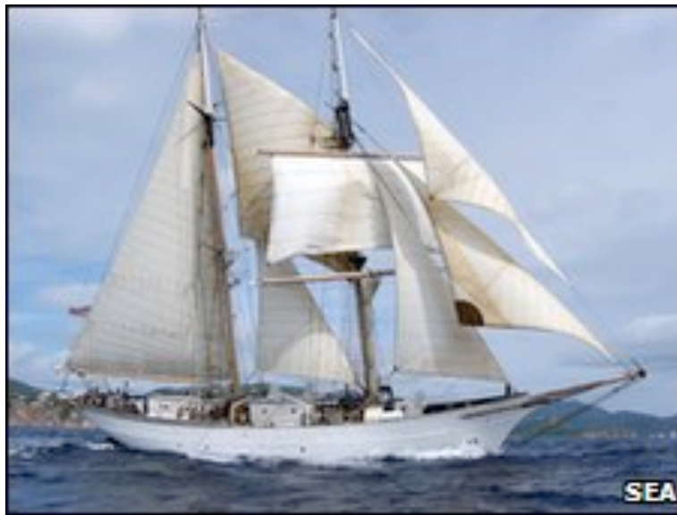
The SSV Corwith Cramer is involved in the plastics research