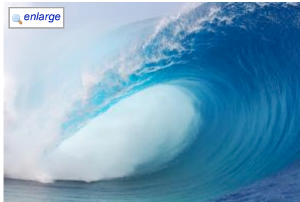
Sea level will likely be 30-70 centimeters higher by 2100 than at the start of the century, even if all but the most aggressive geo-engineering schemes are undertaken to mitigate the effects of global warming and greenhouse gas emissions are stringently controlled, according to new findings.

ScienceDaily (Aug. 24, 2010) — New findings by international research group of scientists from England, China and Denmark just published suggest that sea level will likely be 30-70 centimetres higher by 2100 than at the start of the century even if all but the most aggressive geo-engineering schemes are undertaken to mitigate the effects of global warming and greenhouse gas emissions are stringently controlled.