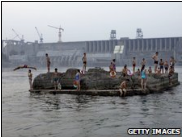
The Danjiangkou dam is being enlarged for the mega-project

China has begun to resettle 330,000 people to make way for a project to divert water from the south of the country to the north, state media say.