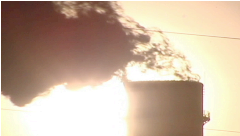
Video: Countdown to Copenhagen

"One big question for us was, OK, we can prove you get an efficiency gain in the gasifier of about 25 percent. But the gasifier is only one part of the overall process in, say, a power plant... But we found that when you put [our techniques] into a much larger system, you still see an improvement of 3 or 4 percent. "That might seem small, but a power plant is hundreds and hundreds of megawatts, so although it's a small percentage, it's still a huge amount.