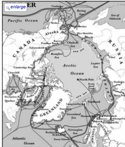
Arctic summer shipping lanes: The Arctic Ocean will never be ice-free in the winter, but summer shipping lanes -- depicted here in this 2004 map - will last longer and penetrate more deeply in the future.

"I kept badgering people for stories about climate change," Smith said. "They'd sigh and oblige me, but then say, 'There's also this oil plant going up behind me or 'All these Filipino