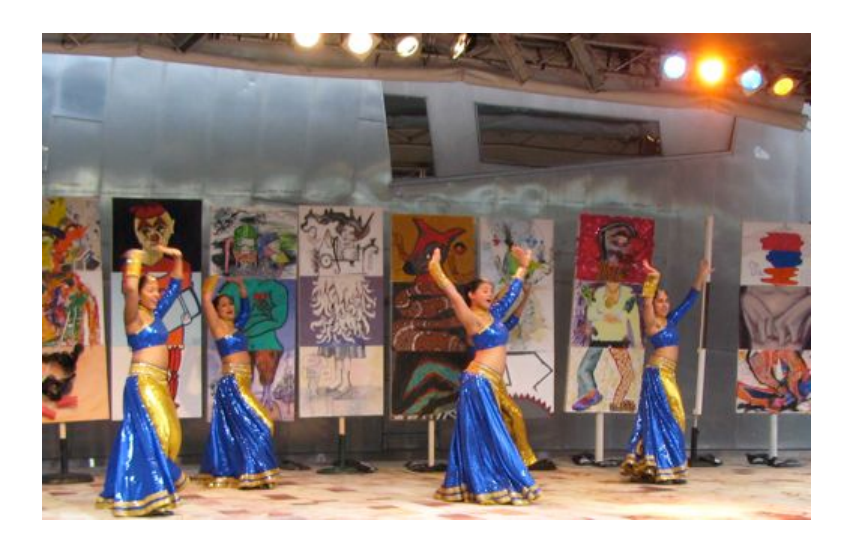
Federation Square Melbourne

23 September 2009 - The inaugural Windows of the World 2009 event united citizens, organisations and communities around projects building capacity for sustainable life.